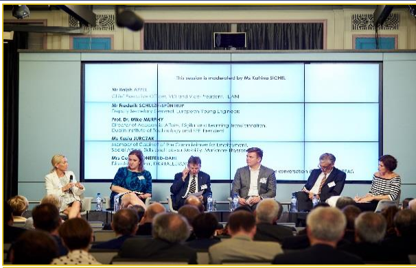
Inauguration of the Engineers Europe Advisory Group : discussion on the issues of digitilisation on 11 Sept 18

Customer.Service@dodsgroup.com | +44 (0)20 7593 5500 | events@theparliamentmagazine.eu