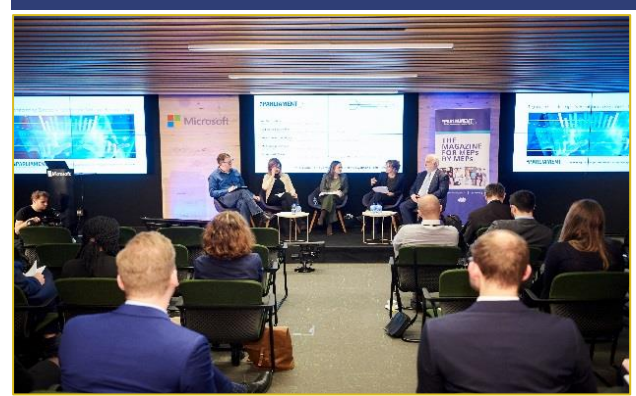
Transforming Europe's healthcare systems through data Thought Leader Live on 26 Nov 18