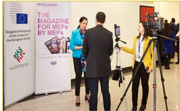
Lilyana Pavlova, Minister of the Bulgarian Presidency of the Council of the EU interviewed at the Presidency Reception