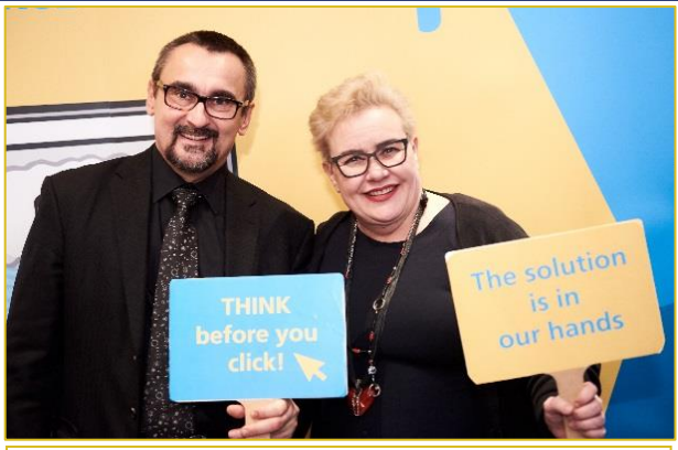
MEPs Pavel Poc and Sirpa Pietikäinen at 'Illegal online pet sales' reception on 27 Nov 18 in